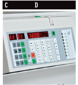
The back gauge control module has a digital display and keypad for programming.