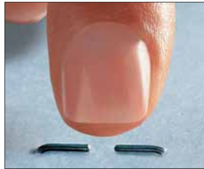
Staple legs are bent and pressed flat after stapling which provides 30% more binder storage