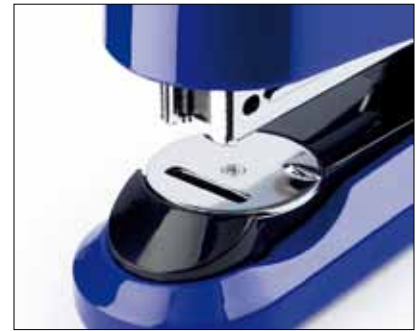
Adjustable insert for permanent or temporary stapling as well as tacking.