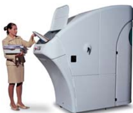
Just press the start button, throw the material into the large entry opening and leave.