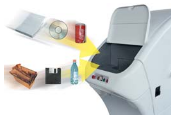
Kobra Cyclone can shred 500 sheets of paper at a time and also credit cards, CDs, Floppy-Disks, Cardboard, Plastic bottles and Aluminium cans.