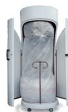
Plastic bags can be easily removed and disposed of assisted by the built-in-trolley.