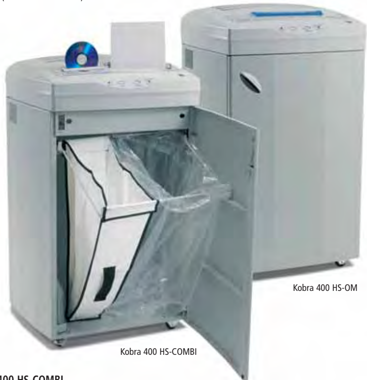
Kobra 400 HS-OM

2 bags separate plastic shreds from paper shreds: 80 liter strong re-usable bag for CD, DVD, Blue-Ray and credit card shreds and a 110 liter recyclable bag for paper shreds (Kobra 400HS-COMBI)