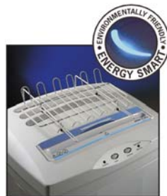
Adjustable computer forms top shelf (Space Saving Design). Integrated sliding flap makes Floppy-Disks and CDs shredding easy