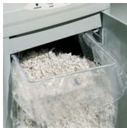
Front door for easy emptying of collecting bag