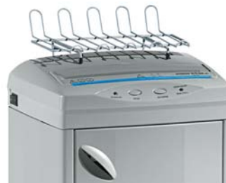
Computer forms top shelf to save office space (Space Saving Design)