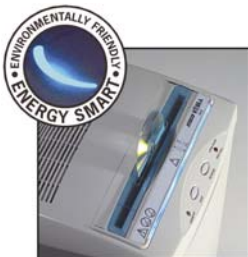
"ENERGY SMART" Management system for zero power consumption in Stand-by mode