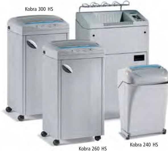
Kobra 300 HS