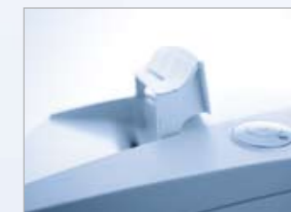
The safety cover can be simply folded up in order to shred large amounts of paper.