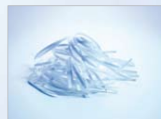
Security level 2 – Strips For internal documents that need to be rendered illegible such as computer lists or bad photocopies. Cutting size: 5.8 mm.