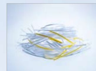
Security level 2 – Strips For internal documents that need to be rendered illegible such as computer lists or bad photocopies. Cutting size: 3.9 mm.