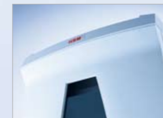
Container handle of elegant design.