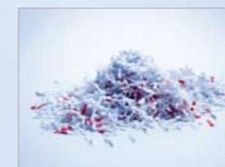
Security level 3 – Particles For confidential documents such as personal data. Cutting size: 4.5 x 30 mm.