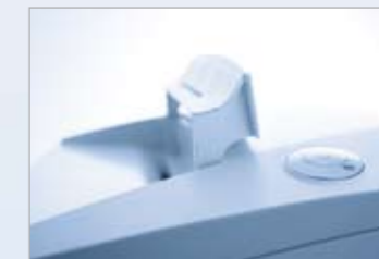
Folding safety element provides optimum protection for the operator.