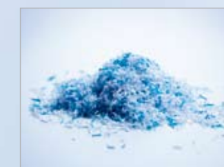
Security level 4 – Particles When the confidentiality of documents is important for a company's existence. Cutting size: 1.9 x 15 mm.