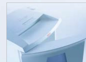
The waste bag can be taken out easily through the large door.