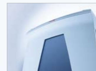
Due to its large collection volume, the SECURIO B34 is suited for use by several persons.