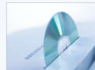
At security level 2, the SECURIO B34 can shred CDs with ease.