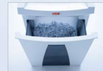
Tilting container for easy removal of the shredded material.