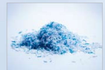
Security level 4 – Particles When the confidentiality of documents is important for a company's existence. Cutting size: 1.9 x 15 mm.