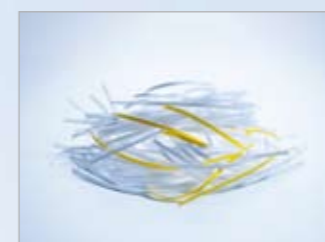
Security level 2 – Strips For internal documents that need to be rendered illegible such as computer lists or bad photocopies. Cutting size: 3.9 mm.