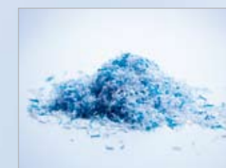
Security level 4 – Particles When the confidentiality of documents is important for a company's existence. Cutting size: 1.9 x 15 mm.