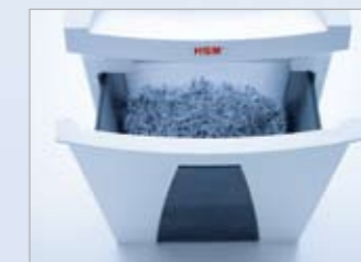
Tilting container for easy removal of the shredded material.