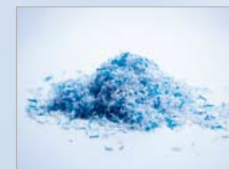
Security level 4 – Particles When the confidentiality of documents is important for a company's existence. Cutting size: 1.9 x 15 mm.