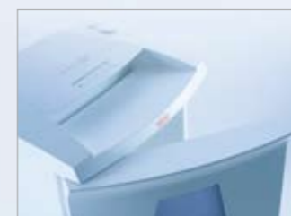
The waste bag can be taken out easily through the large door.