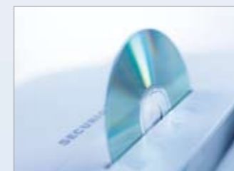
At security level 2, the SECURIO B24 can also shred CDs with ease.