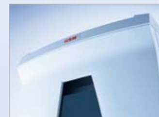
Container handle of elegant design.