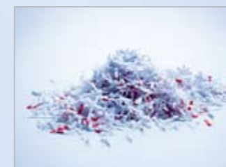
Security level 3 – Particles For confidential documents such as personal data. Cutting size: 4.5 x 30 mm.