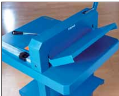
Built in safety covers on both sides of the blade prevent the blade from moving while up.