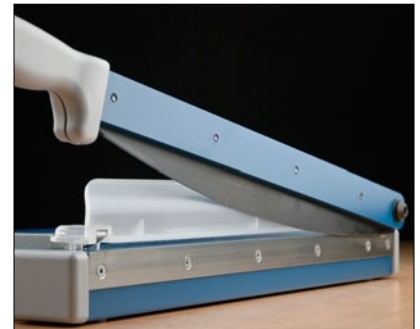
Ground self-sharpening cutting blade maintains a perfectly honed edge.