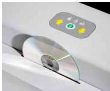
Will shred confidential information on multiple media formats such as Paper, CDs & DVDs.