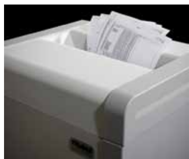
Contemporary wooden cabinet houses shredded waste and deafens noise for quiet operation.

Confidential information can be found in many different formats, so why not have a shredder that can destroy them all? With this in mind, Dahle's developed a new generation of shredders that can destroy more than just paper. The 30406 & 30414 Multi+Media Shredders are designed to shred between 2,000 and 8,000 sheets of paper per day as well as CDs & DVDs. The shredder's contemporary design and large storage capacity make them a nice addition to any large office, copy room or communications center.