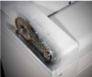
Chain-driven motor provides slip free power to the cutting mechanism.