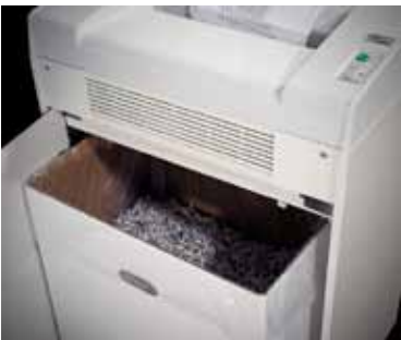
Large 35 Gallon waste compartment requires less frequent bag changes.

Known for their power and waste capacity, Dahle Department Shredders provide a practical solution for accommodating the shredding needs of even the busiest offices. These machines can continually shred large quantities of paper for long periods of time and are designed to shred between 2,000 and 12,000 sheets of paper per day. Their attractive design and large storage bin make them a nice addition to any large office, copy room or communications center.