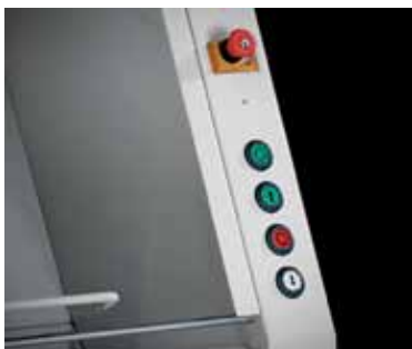
User friendly controls provide ease of use and reduce the chance of injury.

In today's society there's nothing more critical than the accumulation of large volumes of confidential waste. A company's financial records, health information or personnel records can be seen by all if not shredded immediately. Dahle High Capacity Shredders are just the tools to destroy large quantities of paper in a short amount of time. These machines fit nicely in company mail rooms or any other centralized location where large amounts of shredded material is taken. Expensive shredding services are no longer needed with the ability to hold 50 gallons of shredded confidential waste. Not to mention the confidence in knowing your documents are immediately destroyed and can no longer be seen by others.