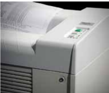
Dahle High Security shredders have been tested and approved by the NSA under NSA/CSS Specification 02-01.

In order to protect our National Security, military and government agencies require higher levels of security from their paper shredders. With this in mind, the U.S. Department of Defense has increased the requirements for the destruction of Top Secret COMSEC documents. NSA/CSS Specification 02-01 is the current standard for maximum particle area and maximum particle dimensions as well as setting a tough standard for machine durability.