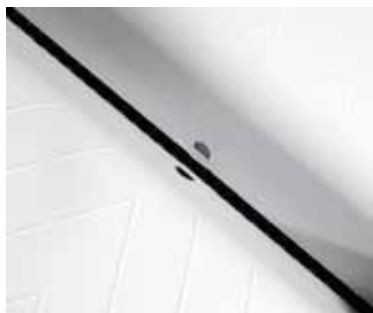
9 1/2" feed opening easily accommodates letter and legal size paper.