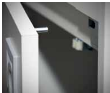
Safety features include automatically shutting off the shredder when the door is open.

Proficiency best describes Dahle's line of Small Office Shredders with their ability to get the job done quickly and easily with minimal effort. Small offices or teams of employees will benefit from the ease of use and quiet operation of these small to mid-size shredders. They're designed to shred between 100 and 400 sheets of paper per day and are perfect for destroying personnel records, client proposals and tax information.